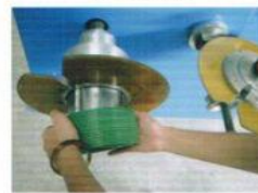
取下线扎 Take Out