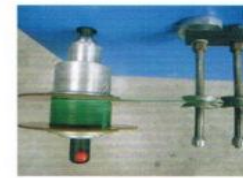
自动排线 Automatically Circling