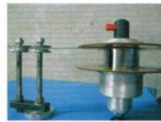
准备排线 Ready for Circling