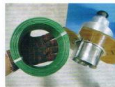
成圈完毕 Circling Done